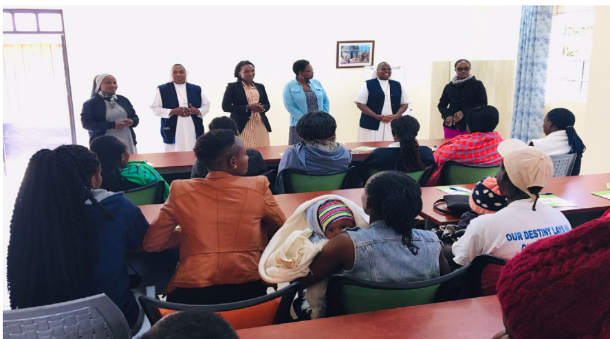
The Mary and Joseph Life Center (MJLC) Team engaging with youths living in the informal urban settlements on the importance of seeking psycho-social support.